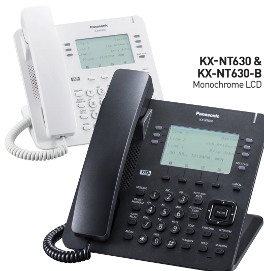
KX-NT630 & KX-NT630-B Monochrome LCD